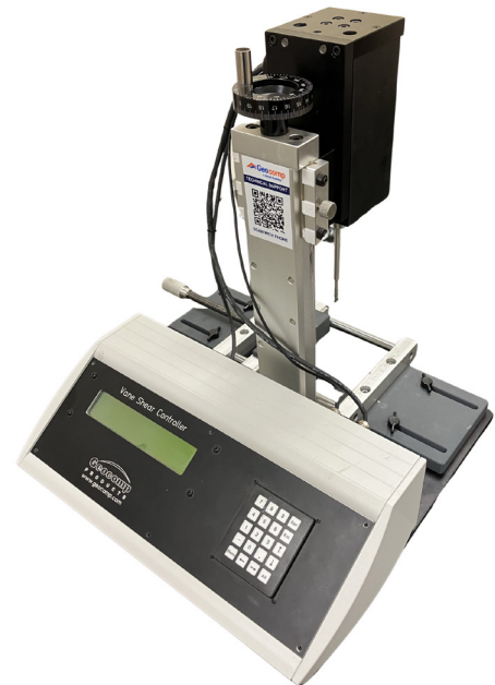
Standard Lab Vane Shear System