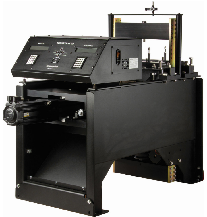
Standard Cyclic Simple Shear ShearTrac III