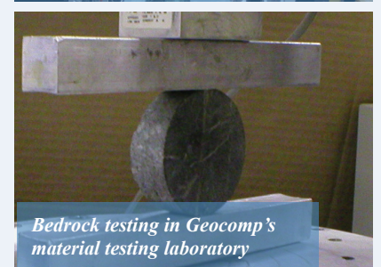
Bedrock testing in Geocomp's material testing laboratory