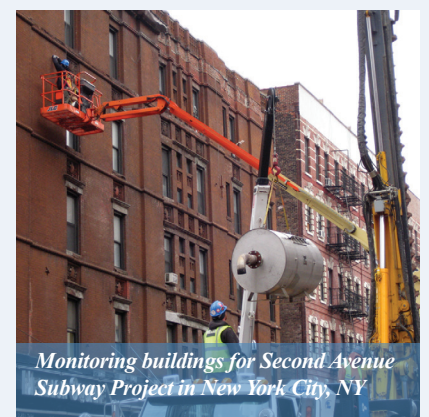
Monitoring buildings for Second Avenue Subway Project in New York City, NY