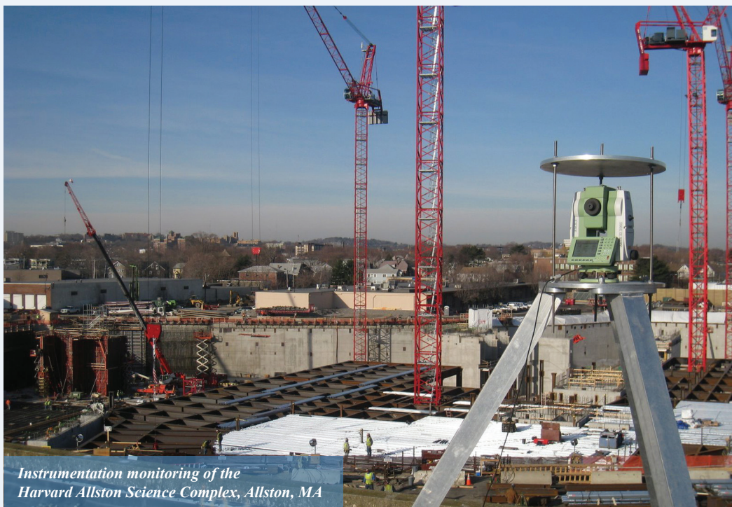
Instrumentation monitoring of the Harvard Allston Science Complex, Allston, MA

Our laboratory's reputation for quality and accuracy is supreme, our services provide high value, and we offer them at a competitive price through the use of one of the most advanced and efficient laboratories in the world.