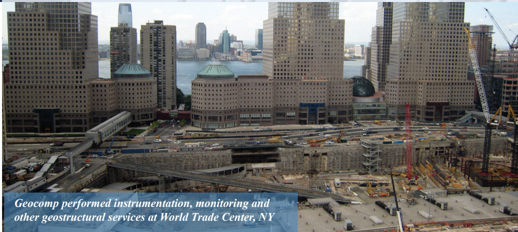
Geocomp performed instrumentation, monitoring and other geostuctural services at World Trade Center, NY