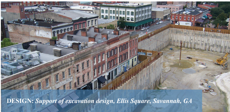
DESIGN: Support of excavation design, Ellis Square, Savannah, GA

Geocomp Products manufactures, sells, and supports automated soil-testing systems used at government, industrial, and university research labs. We also manufacture remote-monitoring systems that provide web-based access to geotechnical instruments used for real-time monitoring of ground performance at construction sites worldwide. We focus on providing products that help our clients complete work faster with high reliability.