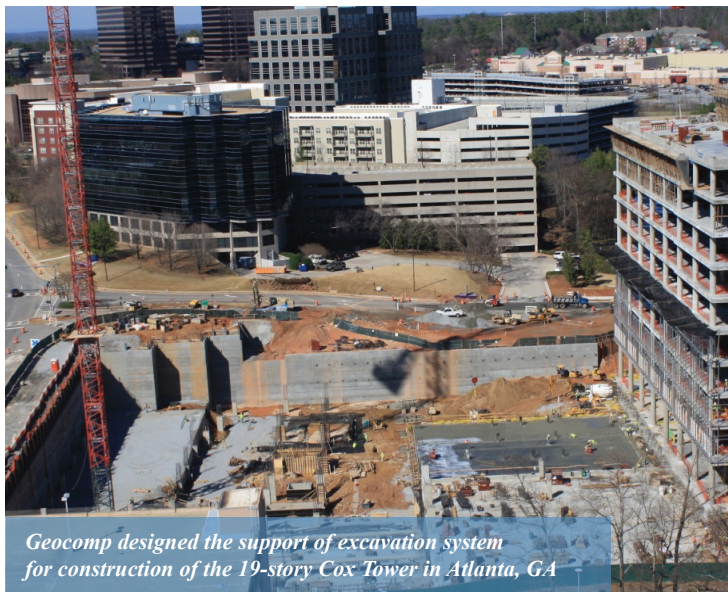
Geocomp designed the support of excavation system for construction of the 19-story Cox Tower in Atlanta, GA

We integrate monitoring data with the project performance predicted during the design phase in order to actively manage risks as they emerge. Geocomp provides the data necessary for the design team to make informed decisions on proactive measures that can be taken to reduce the likelihood of negative project impacts from emerging risks.