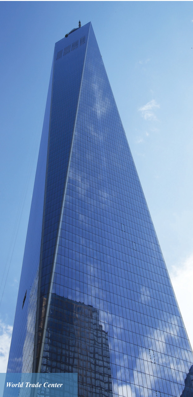
World Trade Center