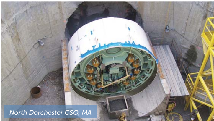
North Dorchester CSO, MA