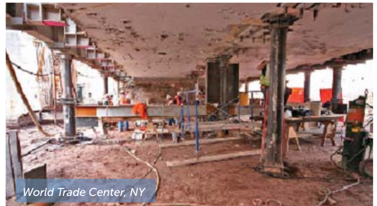
World Trade Center, NY