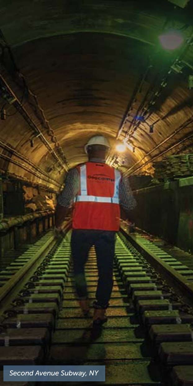
Second Avenue Subway, NY

Technologies to manage risk for infrastructure