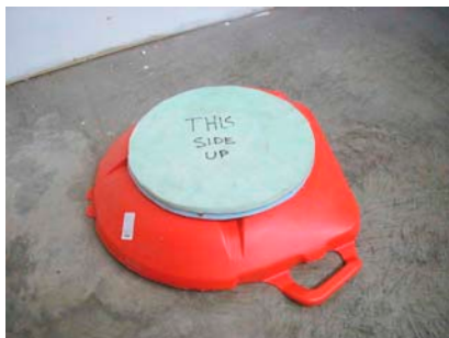
Fig. 1 Base & Specialized Composite