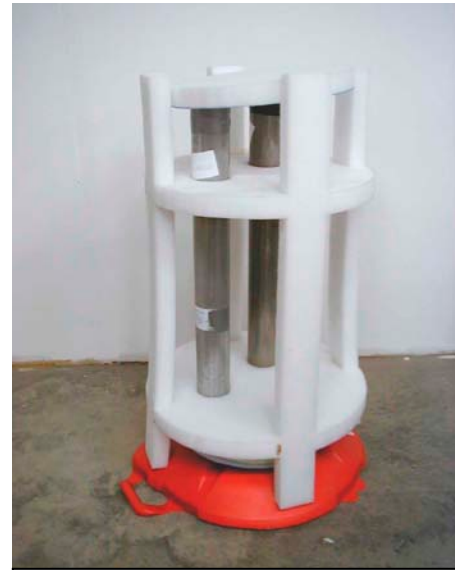
Fig. 3 Packing Insert with Shelby Tubes and Packing Top