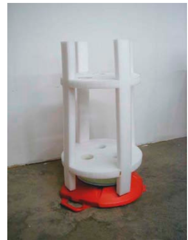
Fig. 2 Base, Specialized Composite and Packing Insert