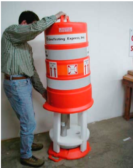
Fig. 4 Placing Barrel over Packing Insert