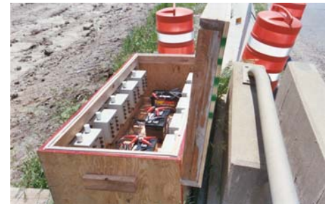
Data loggers in custom built housing with back up power.

The instrumentation used to monitor the performance of the Production and Research test sections consists of: