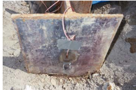
Resistance strain gauge mounted on a steel H-pile.

of the embankment and all instrumentation wiring is run directly to the centralized logger location.