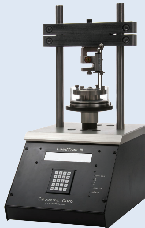
Standard Fully Automated Unconfined Compression System

Optional software running in Windows® completely automates the test, reducing the data and preparing test results.