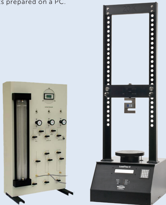
Standard Semi-Automated Triaxial System with Manual Pressure Volume Control Panel

Sensor readings are displayed in SI or English units and stored in memory. With the network communications module and appropriate software, the entire test can be automatically controlled, data captured and displayed in real time, and test reports prepared on a PC.