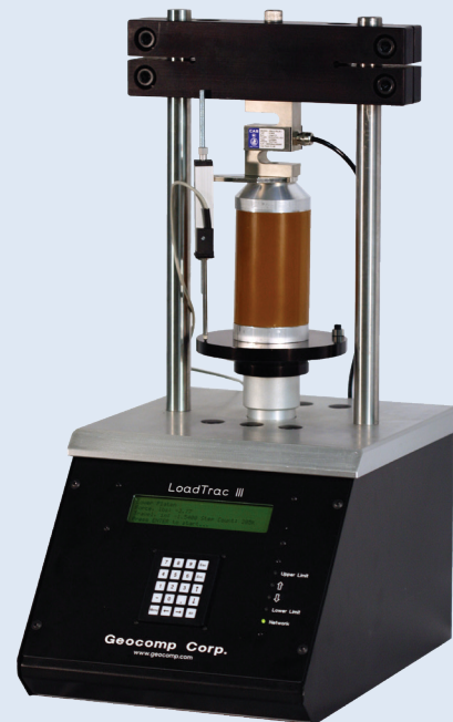
Standard Fully Automated Unconfined Compression System

Optional software running in Windows® completely automates the test, reducing the data and preparing test results.