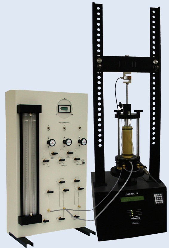
Standard Semi-Permeability FlowTrac II System

With the network communications module and the appropriate software, the entire test can be automatically controlled, data captured and displayed in real time, and test reports prepared on a PC. With GeoNet-LAN option, the test can be monitored and data reported from any PC located on a LAN to which the FlowTrac II system is connected.