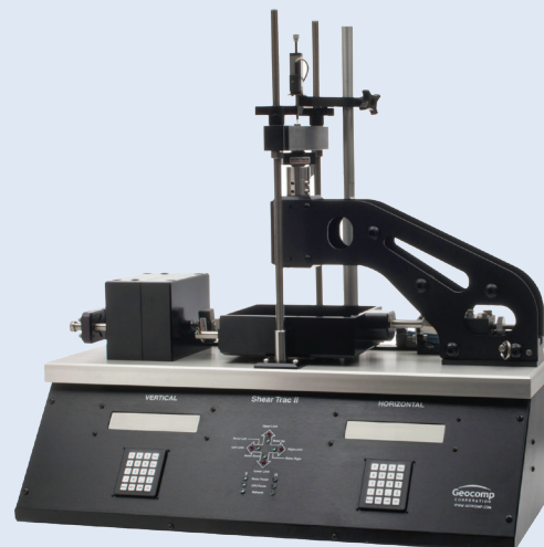
Standard Fully-Automated Cyclic Direct Simple Shear System

The system comes complete with hardware and software for recording all test input data and settings of selected test parameters, performing standard engineering calculations on the data, and producing graphically plotted and printed output.