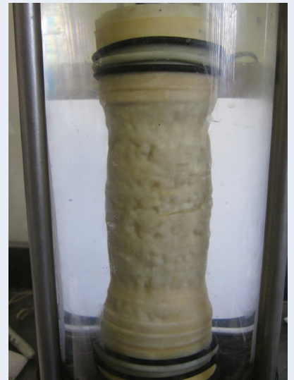
Specimen in triaxial extension test